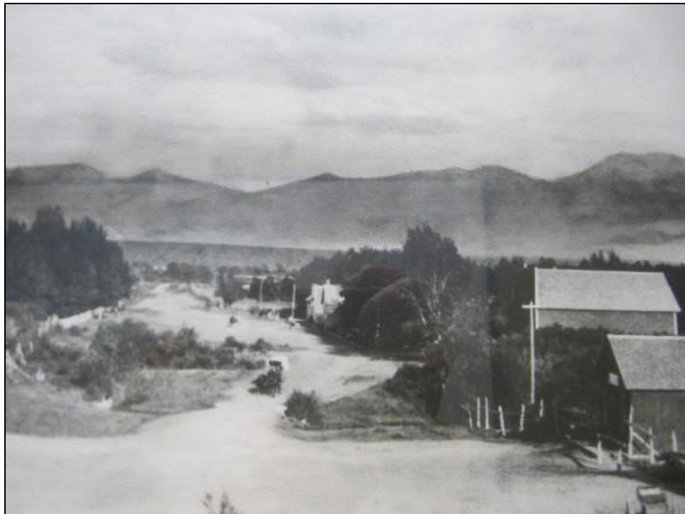
Looking East, down Main Street, Ennis around 1900

WE'RE NOT JUST HERE TO MAKE A LIVING ---WE'RE HERE TO MAKE A DIFFERENCE!